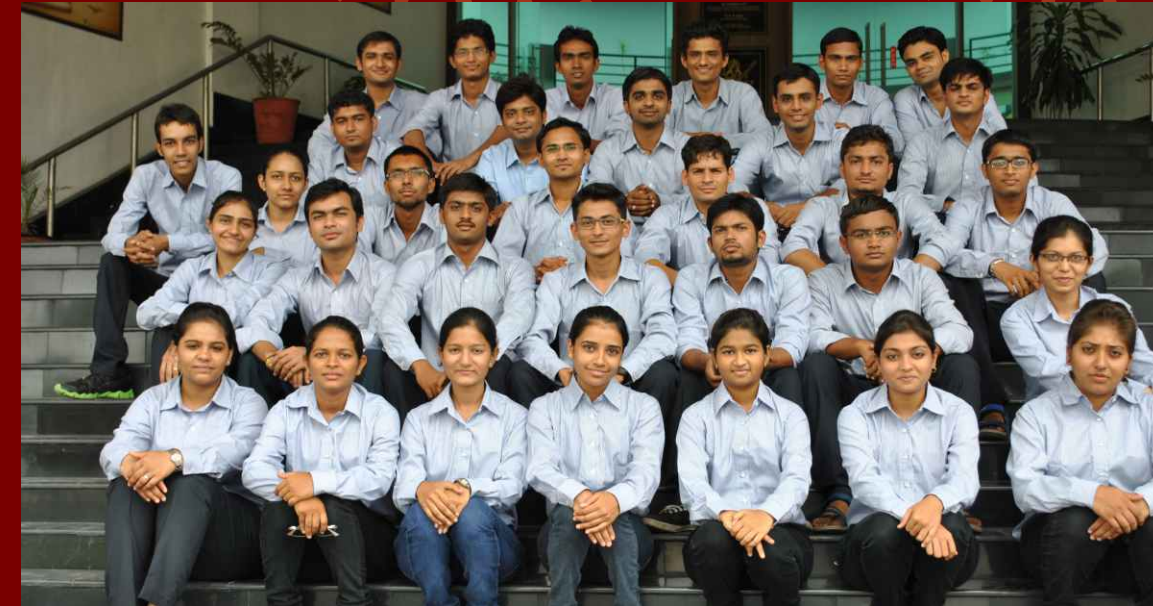
B. Tech (Food Processing Technology) – 2011-2015 batch