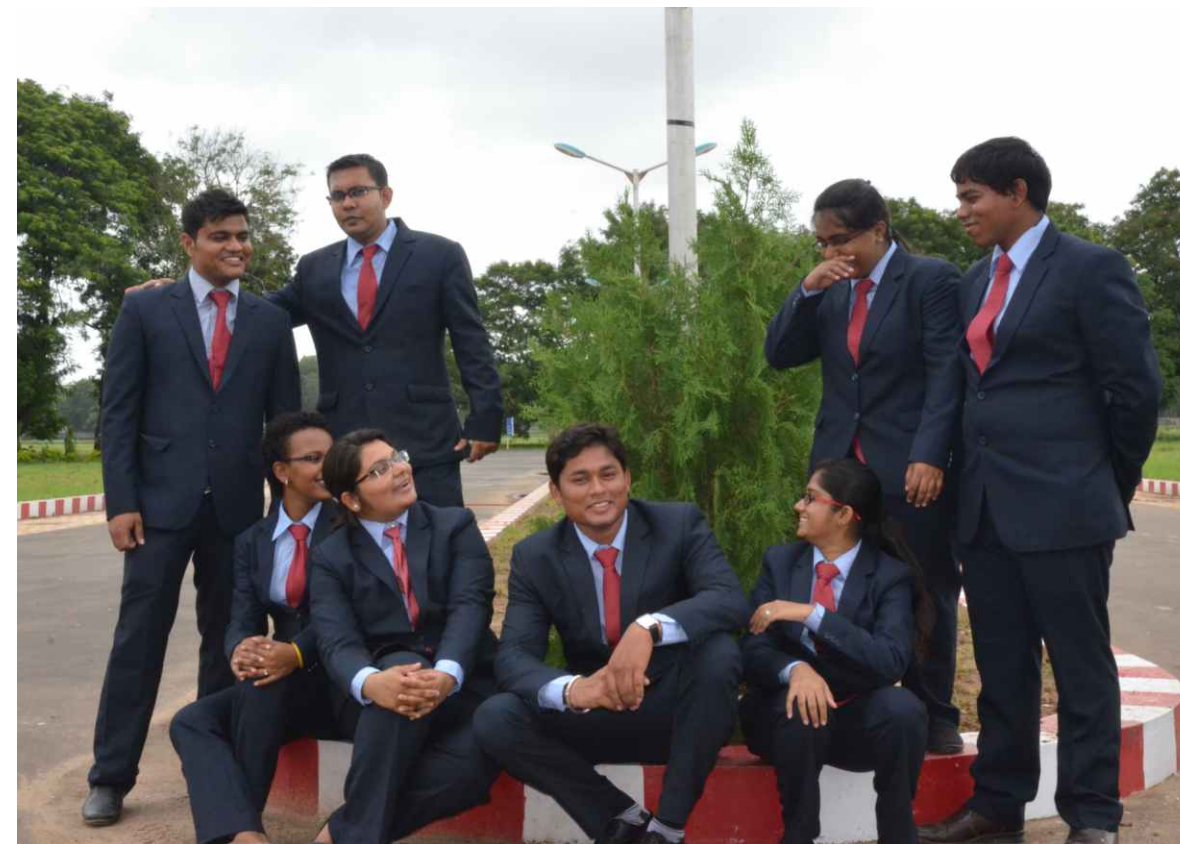
M. Tech (Food Processing Technology) – 2013-2015 batch